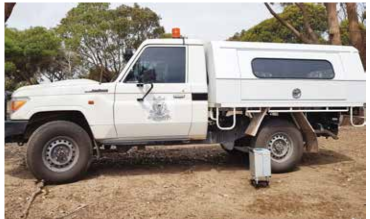
Figure 4. Geological Survey of Victoria vehicle with gravity meter.

Visit Geoscience Australia's Scientific Topics webpage for information on gravity as a geophysical technique www.ga.gov.au/scientific-topics/disciplines/geophysics/gravity