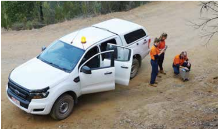
Figure 3. Geological Survey of Victoria gravity survey team near McKillops Bridge, northeastern Victoria.