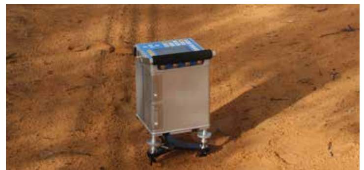
Figure 2. Gravity meter in northwest Victoria (shows footprints and tyre tracks).

The surveyors transport their equipment in light 4WD diesel vehicles. The measurements are passive and do not create any disturbance apart from footprints and tyre tracks (Figure 2). There is no requirement to disturb fencing or other infrastructure, and traffic will not be unduly impacted (Figures 3 and 4).